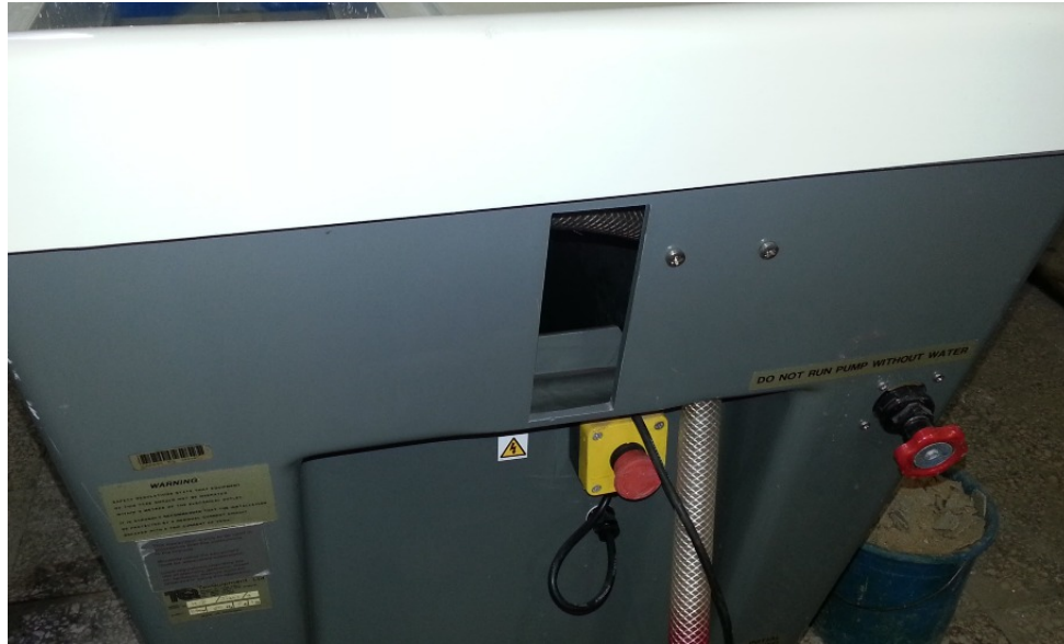
Figure 1: The control valve of the circulation pump.