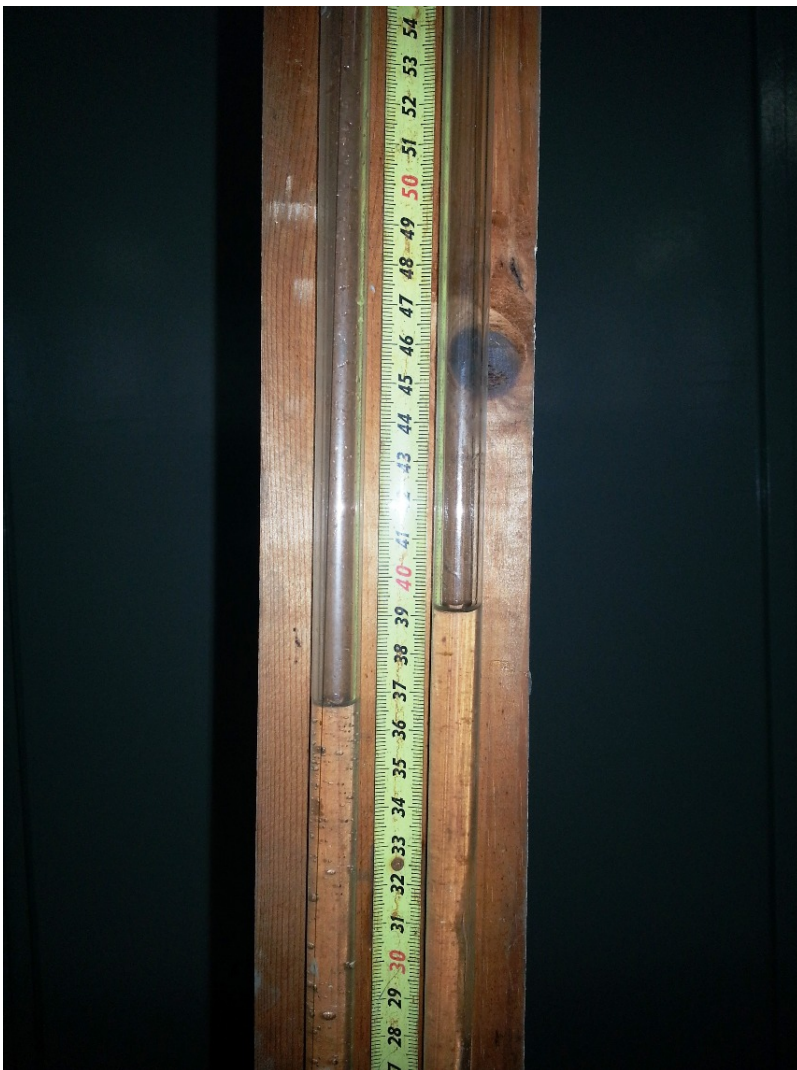
Figure 4: The gage connected to the piezometer tubes.