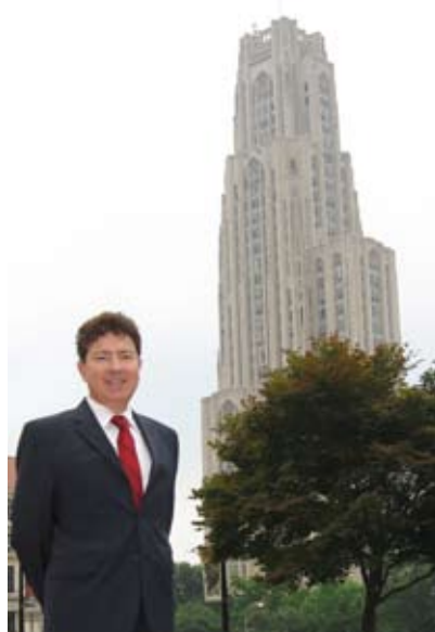
At University of Pittsburgh