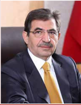
İdris GÜLLÜCE The Minister