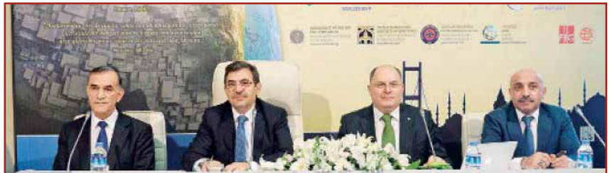
WCS 2015 Press Conference, Istanbul

The WCS-CE is expecting around 2,000 delegates and many visitors to attend this event. As a delegate you will improve your cadastral and land-related industry networks and increase your store of knowledge on the latest global cadastral-based developments, legal, science, technology and strategic issues. You and your organization will benefit from your attendance and the knowledge and networks that you gain.