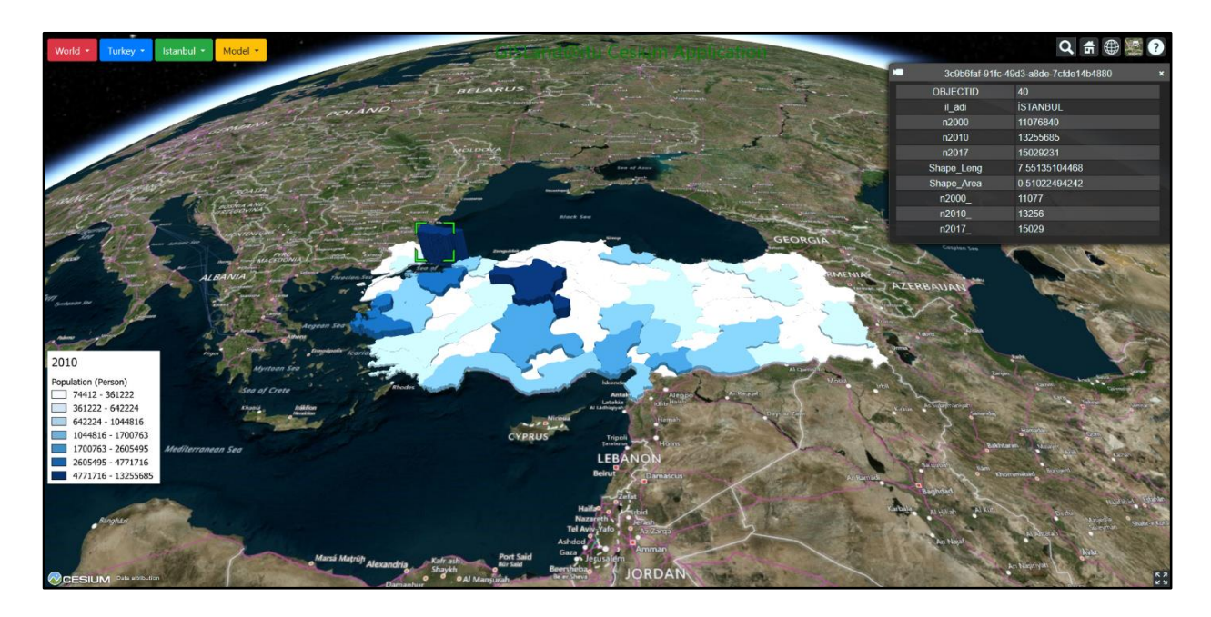
Figure 2. The population of Turkey provinces in 2010