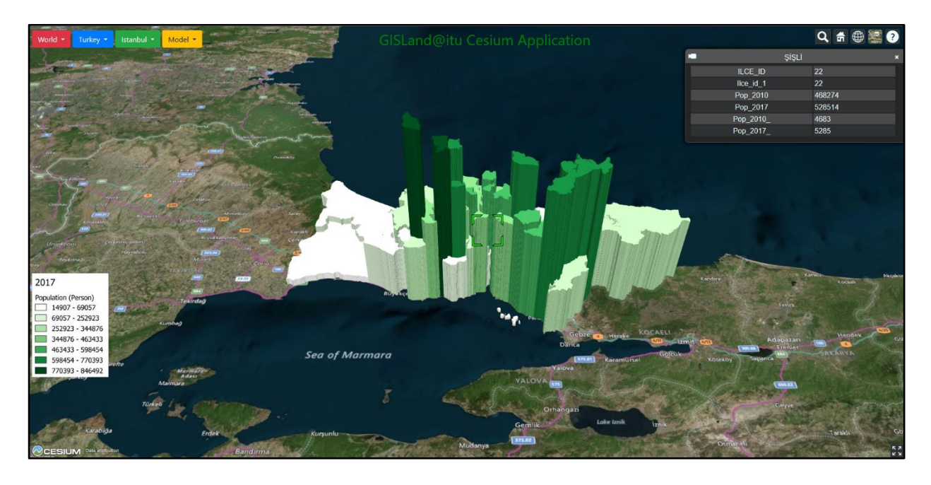
Figure 3. The population of Istanbul province in 2017

Since Cesium provides data interoperability, the projects which are created with using other platforms can be integrated easily. 3D Nominal Land Values of Istanbul City Project is visualized with Cesium JS. The model is created as pixel-based raster data. In order to visualize it on 3D Cesium globe, raster data converted to glTF format using a three.js library, Qgis2Threejs. glTF data format provides visualization of raster data but users cannot query on the data.