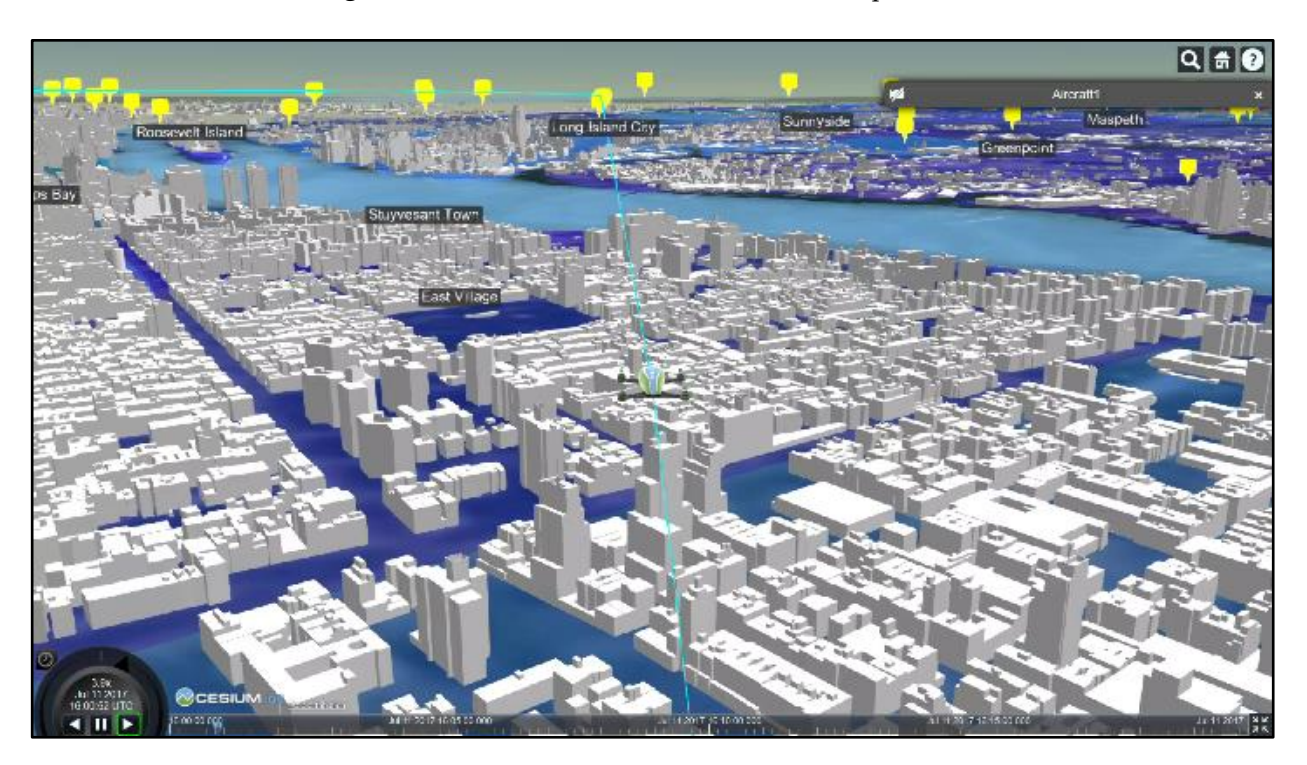
Figure 5. 3D Model of New York City in Drone View