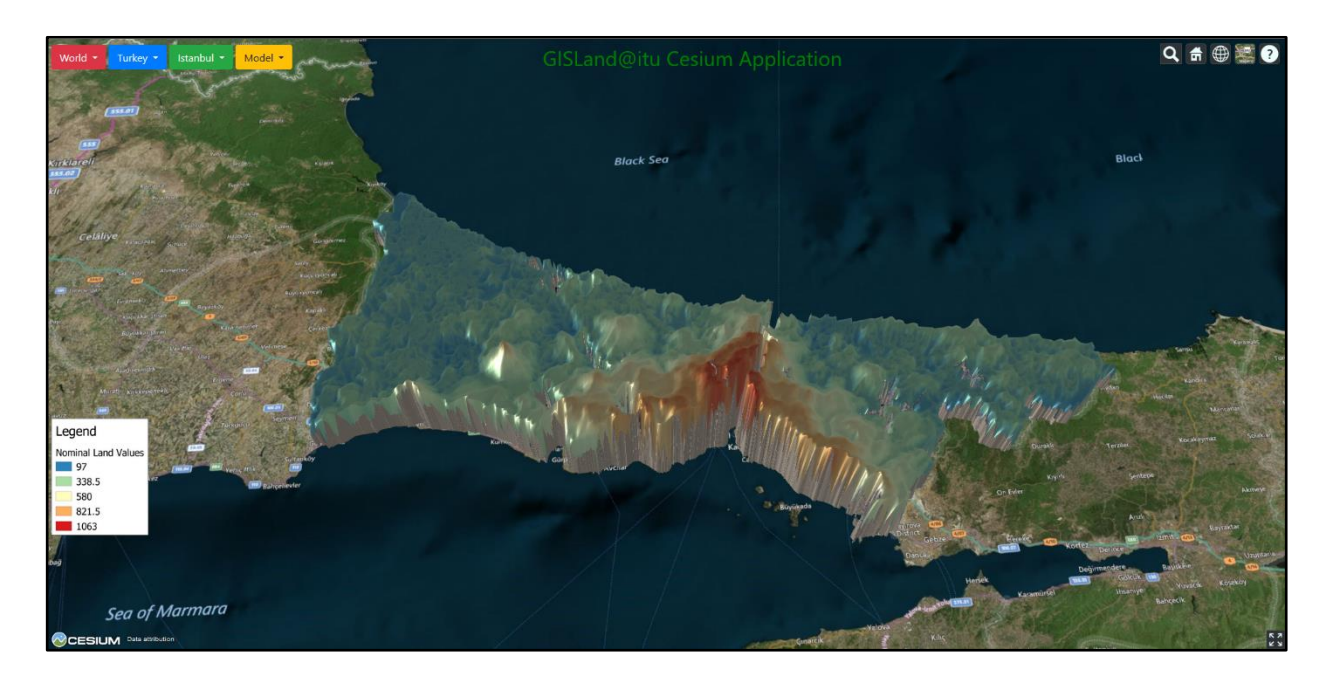
Figure 4. 3D Nominal Land Values of Istanbul province