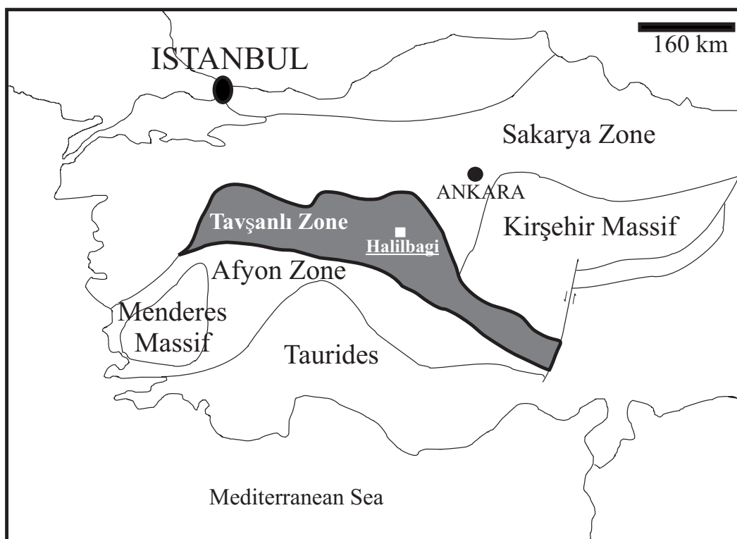
FIG. 1. Location map of the major tectonic units in Turkey, highlighting the Tavşanlı Zone and Halilbagi, the sources of samples 96/69 and 96/152, respectively.

rims after the amphibole classification of Leake et al. , (1997). The \text{Fe}^{3+} in amphibole has been determined according to the recalculation method of Okay (1980b). The core-rim optical zoning observed in amphiboles corresponds to decreasing \text{Mg}^{2+} and increasing \text{Fe}^{2+} from core to rim, with an overall decrease in \text{Al}^{3+} and corresponding increase in \text{Fe}^{3+} . In sample 96/152, the pre-kinematic sub-idioblastic clinopyroxenes are more augitic and with a jadeite component of \text{Jd}_{(21)} , whilst later syn-kinematic clinopyroxenes are much finer grained, less augitic and with a higher jadeite component of \text{Jd}_{(23)} . Both clinopyroxene generations contain Cr; pre-kinematic grains contain an average of 0.30 wt.%, whereas syn- to post-kinematic grains have a lower concentration of 0.19 wt.%. Syn- to post-kinematic white micas, which are aligned with the main foliation are phengitic, with average Si = 3.70 and 3.58 in samples 96/152 and 96/67 respectively. Micas in sample 96/152 do not